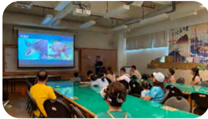
During the sea turtle rescue course, veterinarians provided participants with detailed instructions on how to respond appropriately when encountering stranded or injured sea turtles.