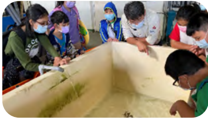
Participants had the opportunity to closely observe the care and rehabilitation of injured sea turtles within the facilities of the rescue center.