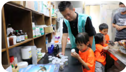
Lead the students to visit the Sea Turtle Rescue and Medical Center and introduce the man-made objects found in the bodies of sea turtles.