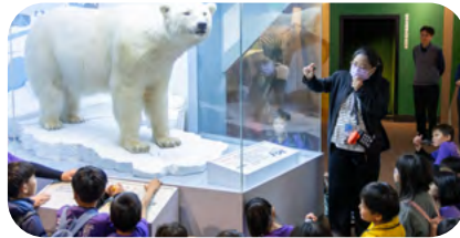
We invited teachers and students from E.SUN Seed School at Qiaorong Elementary School in Taichung City to visit the National Museum of Natural Science. Through observing polar bear specimens, the program aimed to guide students in understanding the environmental impacts of climate change.