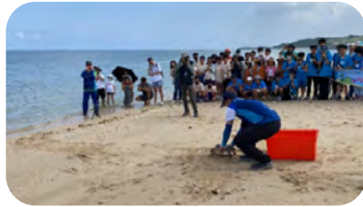
Conducted a sea turtle release event at the conservation beach in Houbihu.